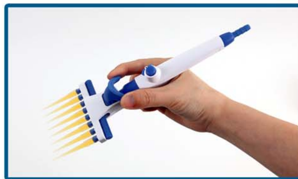
Shown with 8 Channel Pipette Tip Adapter (V0020-8)